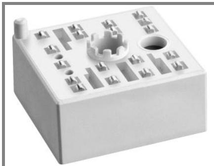
MiniSKiiP ® 0

1-phase bridge rectifier + brake chopper + 3-phase bridge inverter SKiiP 02NEB066V3